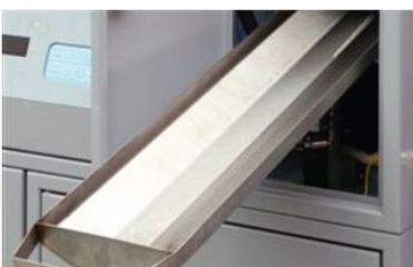
Easy and clean UV oil drip tray removal