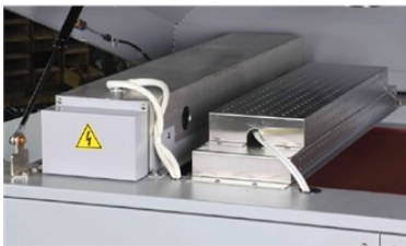
Long conveyor with UV lamp and optional infra-red unit