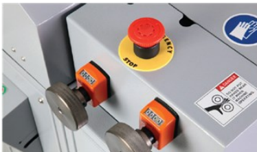
Coating roller gap dials for one-time adjustments